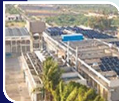
Astro Films Hub, Balochistan