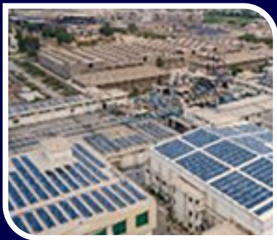
Candyland Hub, Balochistan