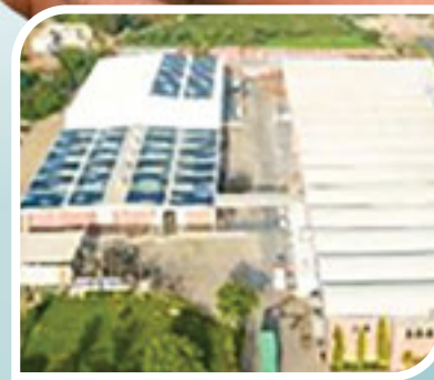
WFP Hub, Balochistan