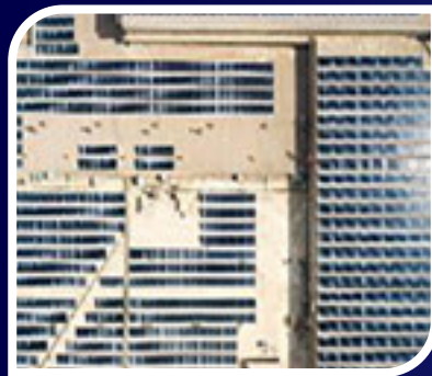
Bisconni Hub, Balochistan